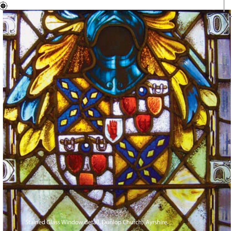
Stained Glass Window detail, Dunlop Church, Ayrshire.

For example, when some of the Ulster-based Presbyterian ministers went back to Scotland in the late 1630s, the Scottish ministers were not impressed by some of the religious practices they had developed in Ulster; in 1640 the General Assembly criticised many of these practices as "Irish innovations". So even by 1640, the cultural practices of the Ulster-Scots were becoming slightly different from those of their Scottish kinsfolk. This process of change and adaptation would continue, right up to the present day.