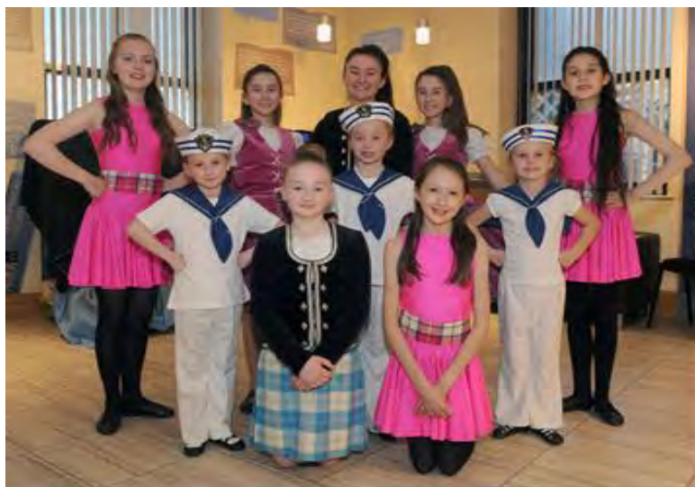
Damhsóirí Garbhchríoch na Soilse Geala ag an Oíche Chultúir, Ionad Eolais na hUltaise, Béal Feirste Bright Lights Highland Dancers at Culture Night, Discover Ulster Scots centre Belfast

Bhí clár siamsaíochta ag Ionad Eolais na hUltaise i gCeathrú na hArdeaglaise i mBéal Feirste mar chuid d'Oíche Chultúir i mBéal Feirste in dtagann 80,000 isteach go Béal Feirste le heispéireas a fháil ar chultúir nua. Bhí an t-ionad i Sráid Victoria oscailte le clár ilghnéitheach a chur i láthair, ina raibh Banna Píob Cuimhneacháin MhicDhòmhnaill, Grúpa Damhsa na Soilse Geala agus taispeántais den cheol gormfhéir. Bhí níos mó daoine ann ná mar a bhíodh le blianta beaga anuas.