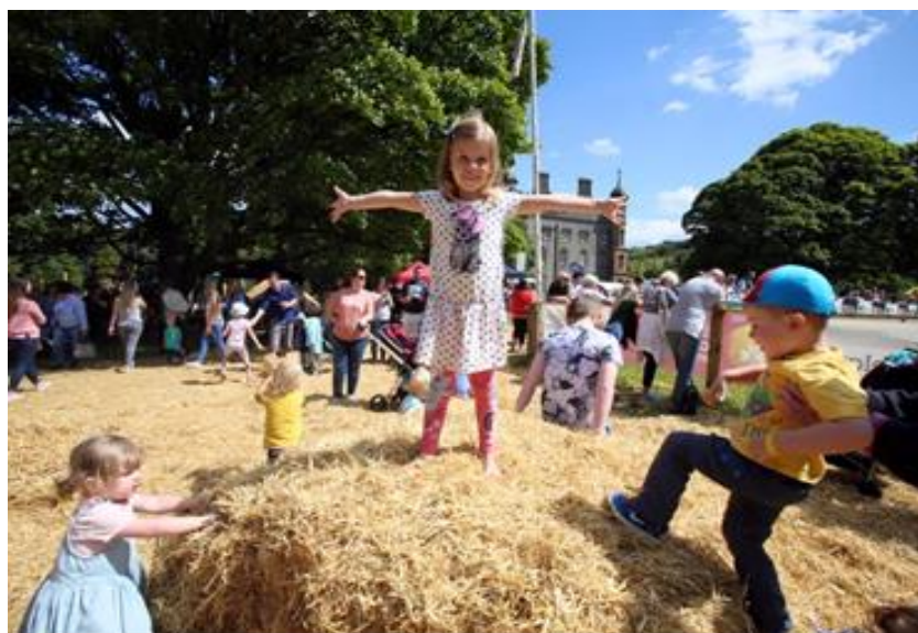
Discover Ulster-Scots Centre Ionad Eolais na hUltaise

The Ulster Scots Agency worked in partnership with Dalriada Festival to promote Ulster Scots to over 28,000 people.